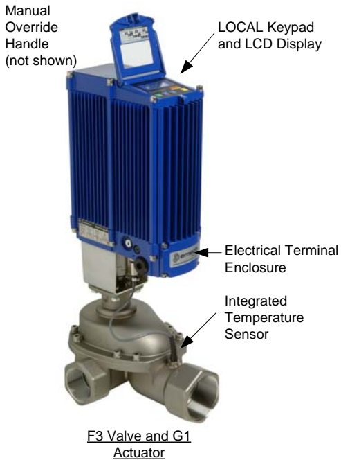
F3 Valve and G1 Actuator